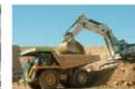
Earth Moving and Mining